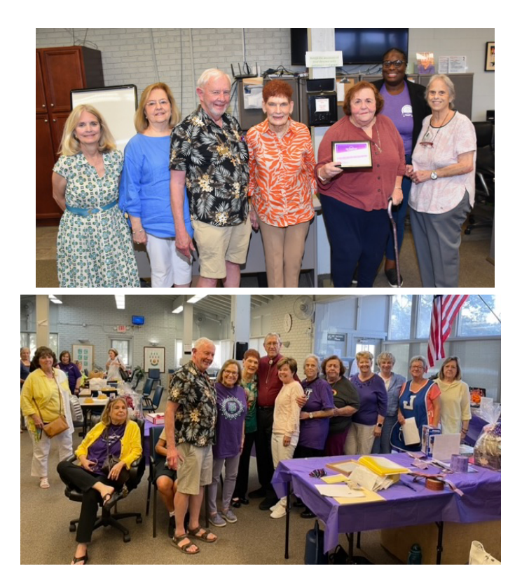
A Team Effort